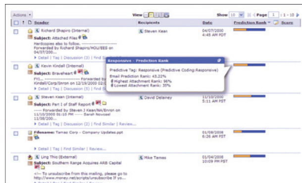
Viewing predictive coding ratings

Predictive Plus sets you up for a smooth review process. After nonresponsive data is removed and our technology conducts a first-pass review, the remaining documents are promoted for subsequent attorney review and tagging. Our pricing model accommodates the reduced document set with a second pricing tier for only the data pushed to review, keeping your costs to a minimum. Plus, our attorneys are available to continue the process with in-depth linear review, providing ease and consistency.